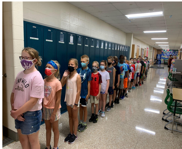
Bauerwood students practicing the Wildcat Way. Safe, Responsible and Respectful